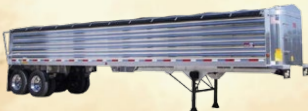
END DUMPS (frameless, -quarter-frame, frame-type)