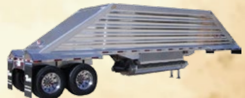
ALUMINUM BOTTOM DUMP